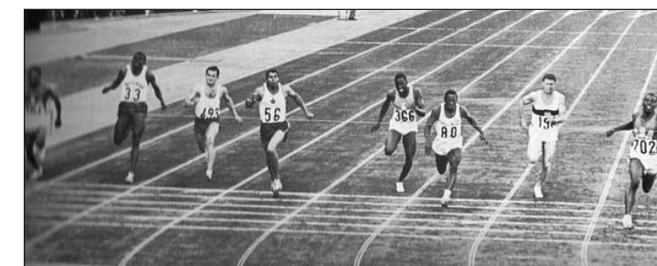
Robinson runs in 100m final in October of 1964 in Tokyo Olympics

2003 World Championships, Paris Bronze, Triple Jump, Leevan Sands