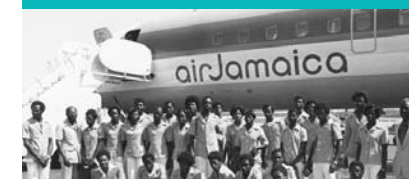
1979 Carifta Team departs Nassau