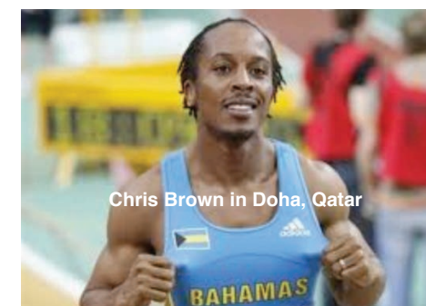
Chris Brown in Doha, Qatar

The year 2010 was a banner year for the BAAA with Chris Brown winning the 400m in the IAAF World Indoor Championships in March in Doha, Qatar, and sixteen year old Shaunae Miller winning the IAAF World Junior Championships in the 400m in July in Moncton, Canada.