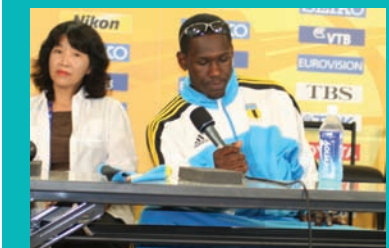
Donald Thomas at Press Conference after Gold medal performance in Osaka, 2007.